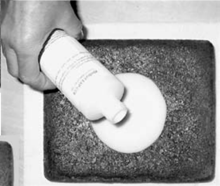
1. Pour on TSR formulated product.