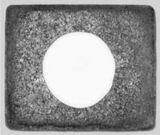
2. Let dry.